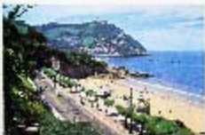
Figure 1.1 Coastal town