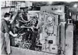
Fig. 1 1944

The machine shown in the photograph is a large, complex piece of machinery, possibly a turbine or engine component. It features a large, circular section on the right side, which is likely a rotor or a similar rotating part. The man is working on the lower part of the machine, possibly adjusting or inspecting a component. The overall appearance is that of a heavy industrial machine.