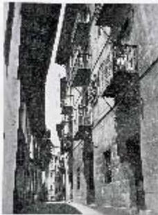
100 The Street