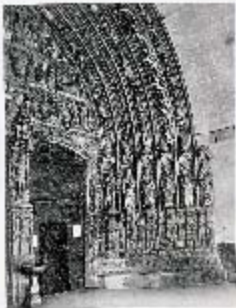
Fig. 1. Roman aqueduct.