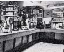
Mr. [Name] [Name]