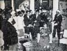
The group at the table