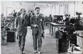
Mr. [unclear] Mr. [unclear]