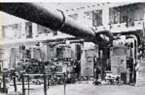
Fig. 1 Fig. 2