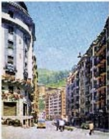
View of the town