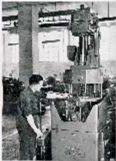
Mr. [Name] is seen here with the [Name] [Name]