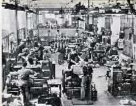
WORKERS IN THE FACTORY

The workers in the factory are busy with their work. They are surrounded by machinery and tools. The atmosphere is one of industriousness and productivity. The workers are dressed in simple, practical clothing. The factory floor is filled with various items, including boxes and papers. The workers are engaged in their tasks, some standing and some sitting. The overall scene depicts a busy and active industrial environment.