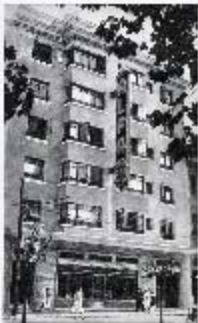
Windsor House 1928-29