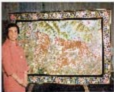
The woman in the red dress is standing next to a large, ornate, floral-patterned frame containing a colorful, abstract painting.