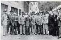
The group of men standing in a line