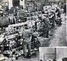
Remains of a destroyed building.