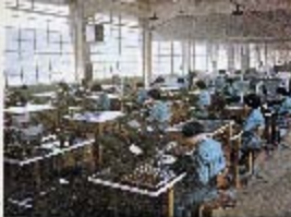
1. The room is a large, open-plan room, possibly a classroom or laboratory. The room is filled with rows of desks and chairs. In the foreground, several square tables are set up, each with a white border and containing various items, possibly for an experiment or activity. The room has large windows on the left side, and the overall atmosphere is one of a busy, organized space.

The room is a large, open-plan room, possibly a classroom or laboratory. The room is filled with rows of desks and chairs. In the foreground, several square tables are set up, each with a white border and containing various items, possibly for an experiment or activity. The room has large windows on the left side, and the overall atmosphere is one of a busy, organized space. The room is a large, open-plan room, possibly a classroom or laboratory. The room is filled with rows of desks and chairs. In the foreground, several square tables are set up, each with a white border and containing various items, possibly for an experiment or activity. The room has large windows on the left side, and the overall atmosphere is one of a busy, organized space.