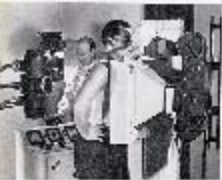
Mr. [Name] [Name]