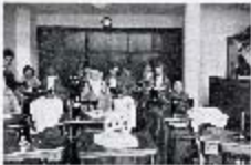
A group of young women sitting around a table in a classroom.