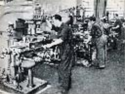
WORKERS AT THE MACHINE

The workers in the factory are busy at work. They are operating the machines and producing goods. The factory is a large building with many windows. The workers are wearing uniforms and are working hard.