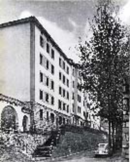
THE UNIVERSITY BUILDING AT BOSTON