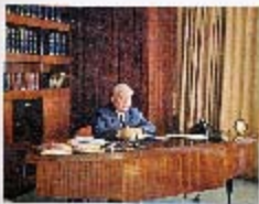
JOHN F. KENNEDY 1961-1963