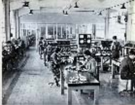
CAFETERIA AT SCHOOL

The cafeteria is a place where students can relax and enjoy their meals. It is a social hub where they can talk to their friends and catch up on the latest news. The cafeteria is also a place where students can learn about nutrition and healthy eating habits.