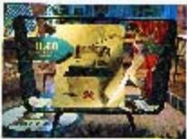
Figure 1. A yellow rectangular object with a large red character and other symbols, possibly a piece of fabric or paper, displayed on a black metal stand.