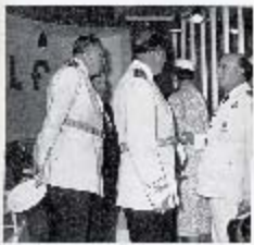
THE TABLE OF