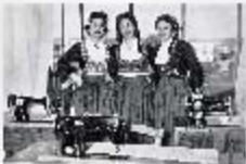
Three young women sitting on a table in a sewing room.