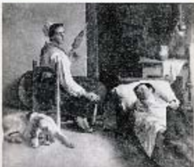
THE MAN IN THE WHEELCHAIR