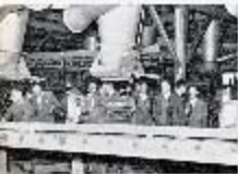
... .. ... .. ... .. ... .. ... ..