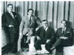
MEMORANDUM FOR THE RECORD SUBJECT: [Illegible] DATE: [Illegible]