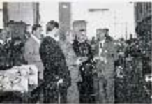
... .. ... .. ... .. ... .. ... ..