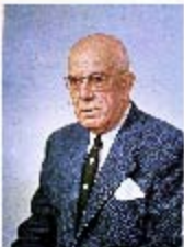
W. H. H. H.